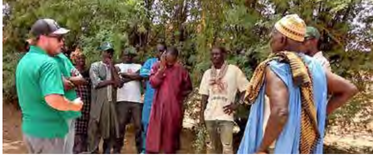
Meeting with the representatives of a primary school.

You have made a huge difference this year, transforming communities half a world away. 2018 has been a big year for Andando and our partners with the introduction of new programs and the expansion of existing ones, our reach is now impacting more people than ever.