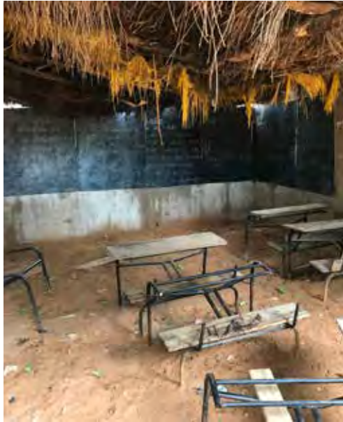
A temporary classroom with the roof collapsing.

100% of gifts made toward this project will be matched!