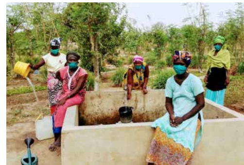
Thousands of masks have been given out to garden participants so they can safely keep providing food for their families.