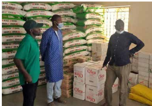
Working with local leadership to organize emergency distributions of food and sanitation supplies.

HEAR MORE FROM SAMBA AT ANDANDO.ORG/NEWS