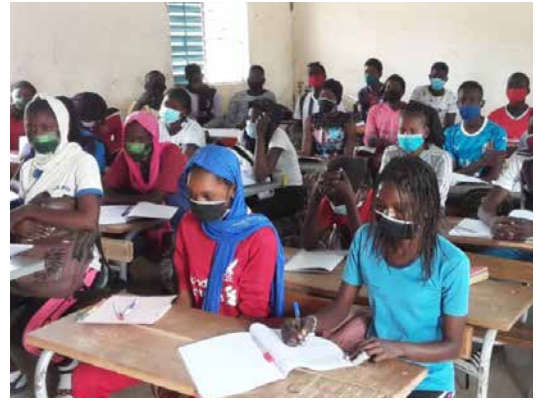
Students at the local middle school who will be among the first to attend the Keur Socé High School. This will reduce barriers to success for students from Keur Socé and surrounding villages.