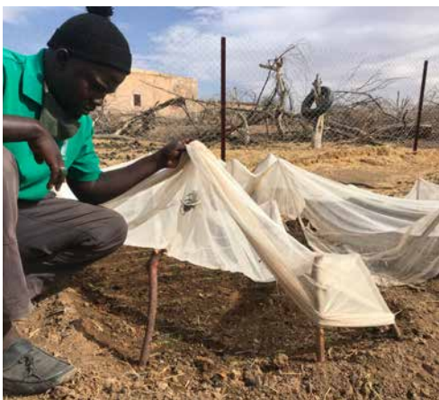
Checking to see how the seeds are germinating under the protective cover.

VISIT ANDANDO.ORG/TEAM TO SEE MORE OF SALL AND HIS FAMILY