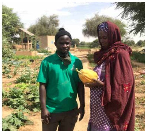
Working with garden participants includes teaching agriculture techniques as well as garden management and cooperation.