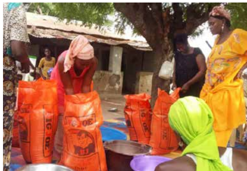
Once supplies reach rural villages, they are distributed among families, with special care given to those most in need.