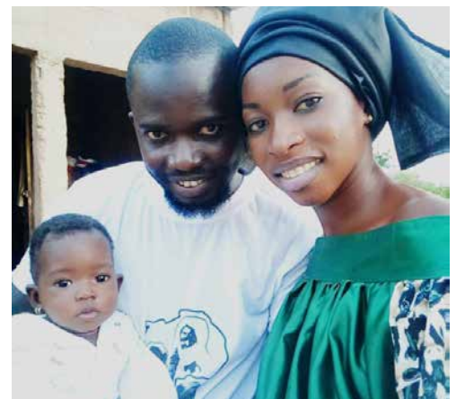
Sall with his wife, Amanatou, and their daughter, Ndeye.