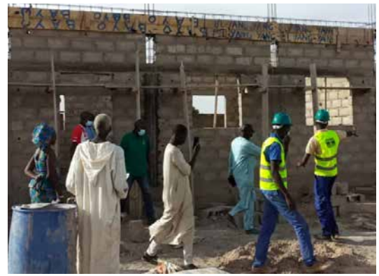
Construction is underway on the building that will serve as freshmen classrooms in the Keur Socé High School. This collaboration is over a decade in the making and will educate future leaders for generations to come.