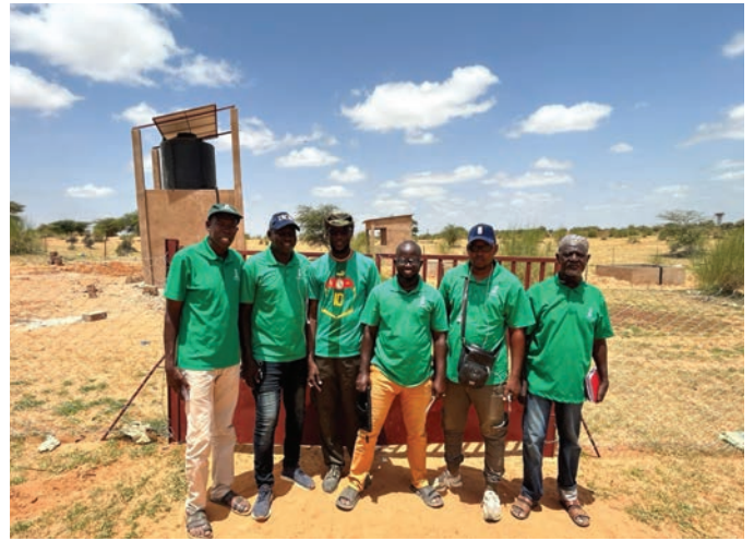
Some of the amazing Podor team standing in front of our newly completed tree nursery, which will drastically increase the rate at which we can build new gardens.