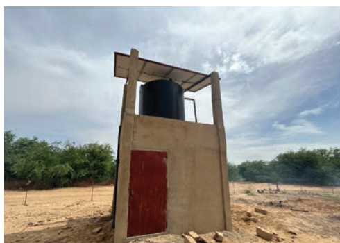
With the fence, basins, and solar pump system complete the women of Wouro Kelle are ready to start their first ever dry season gardening campaign.