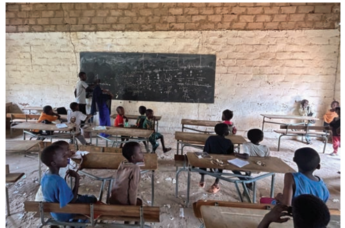
A potential new partner school in the neighboring commune of Ndiédieng, next to Keur Soce.