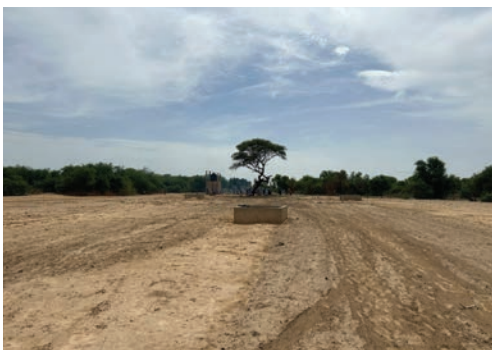
This barren plot will soon be a lush permaculture garden providing a permanent source of nutrition and income for the whole village.

Lead photo caption: Women from the village gather under the shade of the single tree in plot to dance and celebrate the start of the garden.