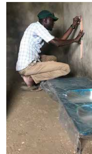
Installing plumbing and sinks at Keur Ngor health post.

More photos and story at Andando.org/News