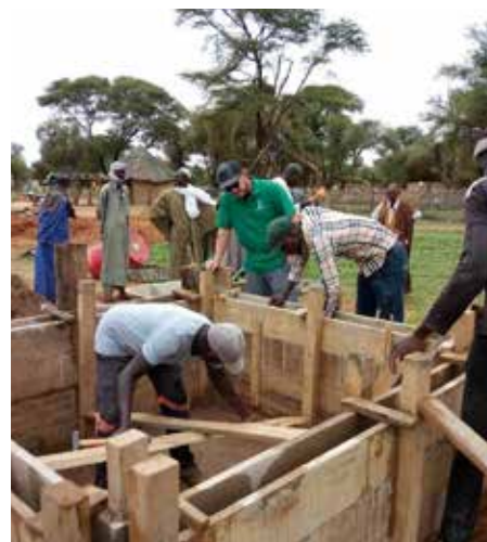
Construction of a garden basin at Mbantou Croissement.