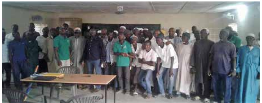
Recipients of this year's microloan distribution, many of which are farmers, will be able to expand their plantings and harvest.

We recently had a loan distribution event where dozens of local farmers received a loan to assist with the planting of their fields as the rainy season progresses. We have been doing this program for over 10 years and have witnessed life-changing results for many involved. With over a thousand loans going out over the years, we have had about a 98% pay back rate!