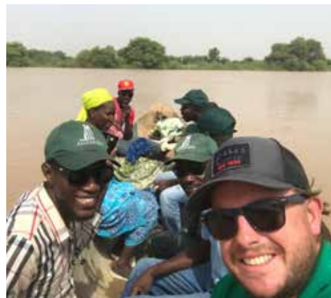
Crossing the Doue River to see a new health post at Dado. Recent rains have washed out the roads.

Hello everyone and greetings from Senegal! Nanga def?!