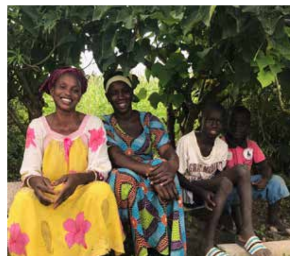
Midwives who will staff and run the health post in Batara Wolof.

Previously, people in these communities would often have to travel long distances, by foot or donkey cart, to seek care for even routine medical care. Even worse, many women would have to make this trek while in labor to safely give birth at a medical facility. This led to alarming rate of births taking place in unsafe and unsanitary conditions... CONTINUED ON PAGE 3